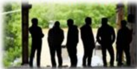
Increase of visitors