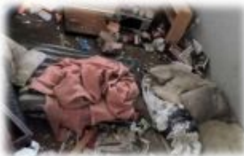
Prep & Distribution