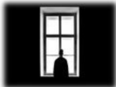
Disengagement from services