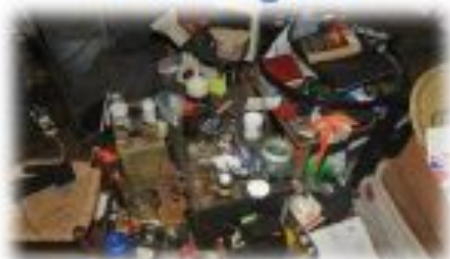
Signs of prepping drugs and drug use